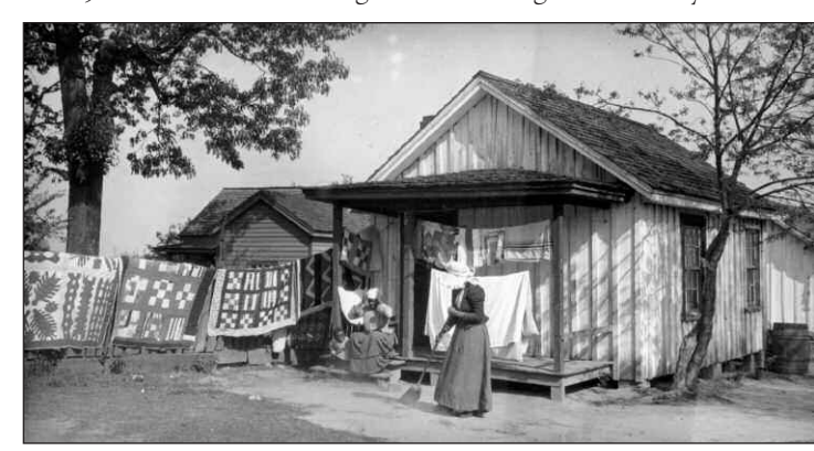
African American women with quilts, probably in Alabama, late 1880s

Taken between the late 1880s and 1915, the photos capture many of the Thorp and Dana children (grandchildren of the poet) together with their friends and pets, and often at their summer homes in Manchester-by-the-Sea or on Greenings Island, Maine, Also