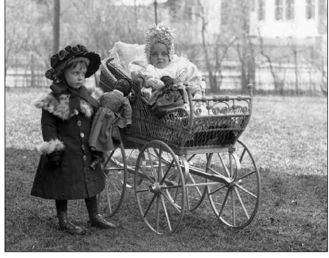
Thorp girls with black dolls, late 1880s