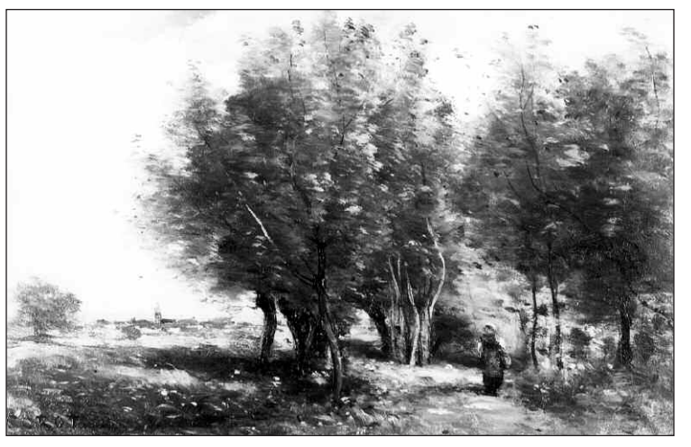
Landscape by Jean-Baptiste-Camille Corot, 1860s, in front hall, second-floor landing

venerable table at its side to keep it in countenance. John Neal [art critic] prophesied we should fill our house with trumpery